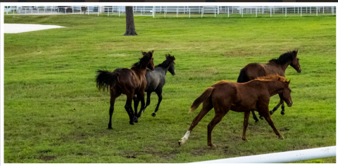
PASTURES & PADDOCKS