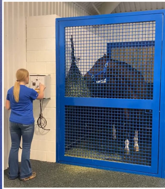
Vibration Plate Floor Stalls