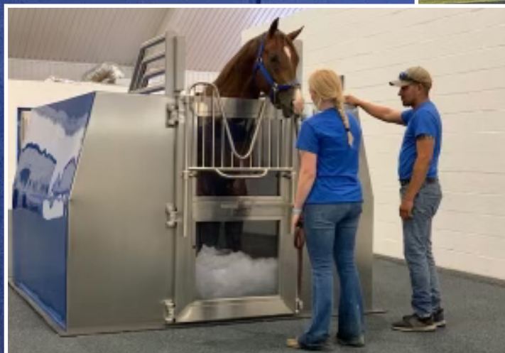
Cold Saltwater Spa