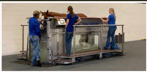
FITNESS & THERAPY CENTER