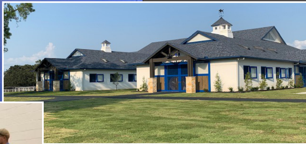
State of the art Facility